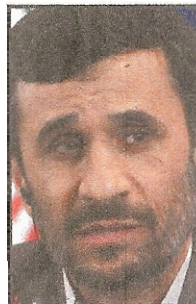
Iranian President Mahmoud Ahmadinejad