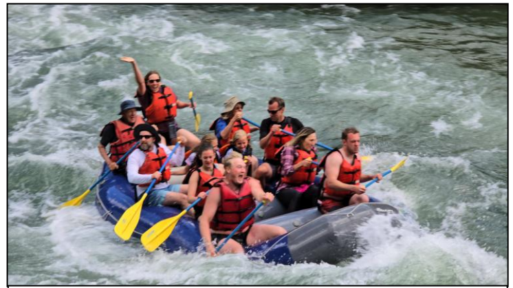
.....and on the water