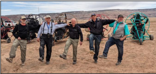
A group of high-stepping pilots at the San Rafael Swell...