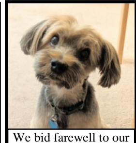
We bid farewell to our beloved Kipper