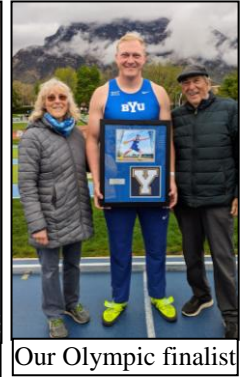
Our Olympic finalist