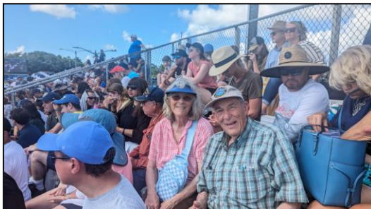
In the bleachers at Cape Canaveral to watch..... Starliner lift off

We also used our motor home, e-bikes, and canoe for several shorter trips around Utah's mountains, lakes and deserts.