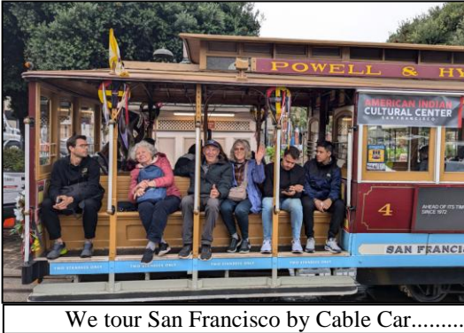
We tour San Francisco by Cable Car.....