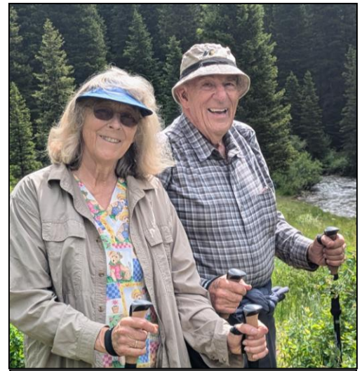
Hiking near Camp Darby