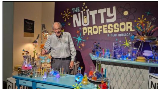
Keena couldn't resist taking this picture