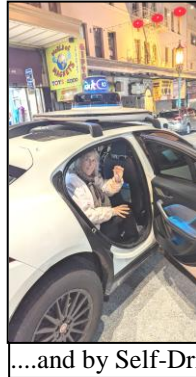
....and by Self-Driving Waymo Car! (see link on previous page)