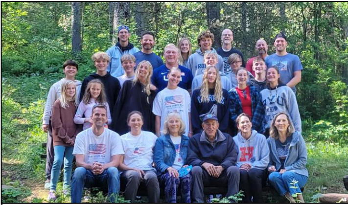
The Darby Group in the forest.....