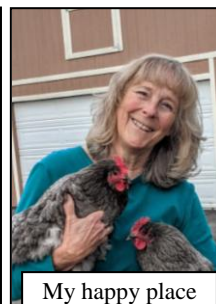
My happy place