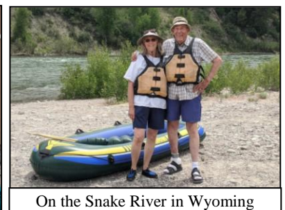
On the Snake River in Wyoming

And so we look forward to 2022 with hope and optimism for a healthy, happy and peaceful year. We continue to count our associations with you to be among our greatest blessings. We send our love and best wishes,