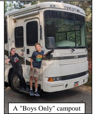
A "Boys Only" campout