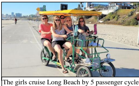
The girls cruise Long Beach by 5 passenger cycle