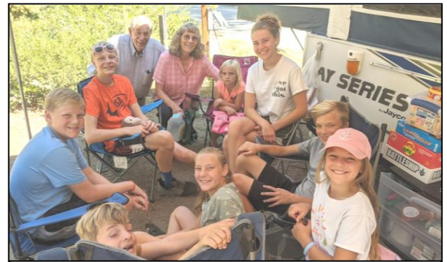
We love camping out with family