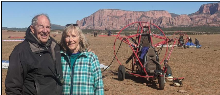
A Southern Utah Fly-in - about 30 aircraft. We land on a mesa near Zion Nat'l Park.