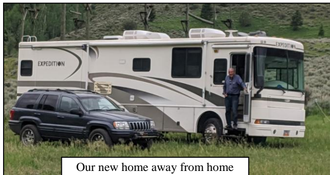
Our new home away from home