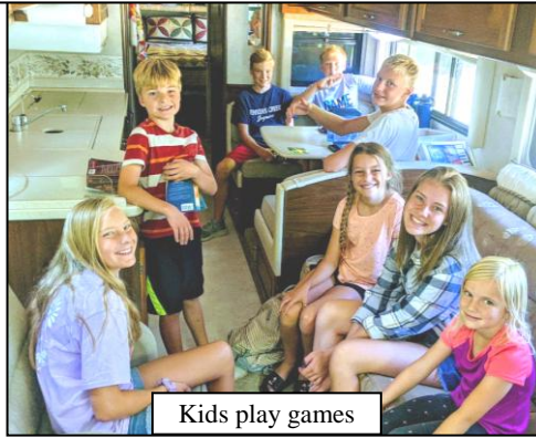
Kids play games