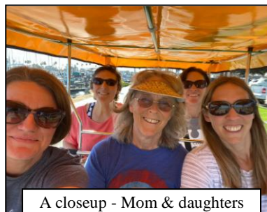
A closeup - Mom & daughters