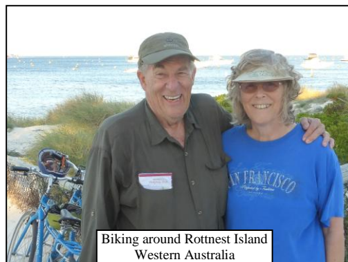
Biking around Rottneest Island Western Australia