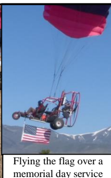
Flying the flag over a memorial day service