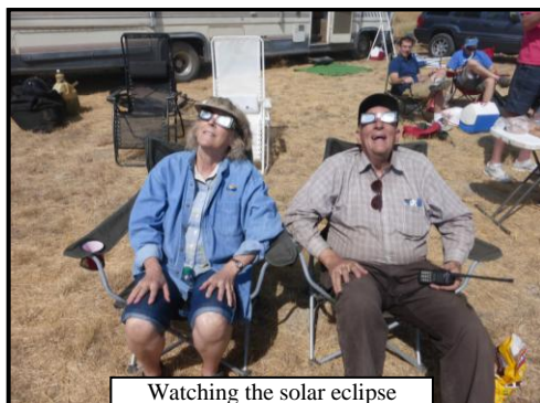
Watching the solar eclipse