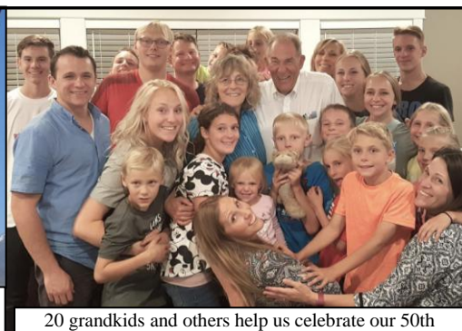
20 grandkids and others help us celebrate our 50th