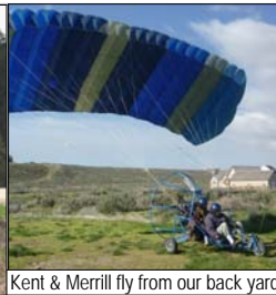
Kent & Merrill fly from our back yard