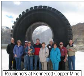
Reunioners at Kennecott Copper Mine

July 13-16: We helped organize and then participated in a "Trek" experience, retracing parts of the route covered by some of the early pioneers as they opened up the west. This particular event focused on the pioneers who pulled handcarts from Iowa City to the Salt Lake Valley in 1856 – a heroic and partly tragic story. We returned with a renewed sense of appreciation for the sacrifices of those who paved the way for the blessings we enjoy today.