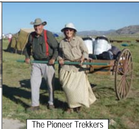
The Pioneer Trekkers