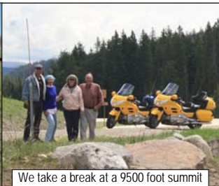
We take a break at a 9500 foot summit