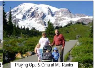
Playing Opa & Oma at Mt. Ranier