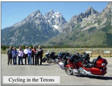
Cycling in the Tetons

But while we are trying to stay young, we look at our 27 grandchildren – with two new arrivals this year - and realize that time is marching on. They’re pretty widely scattered but we were grateful to have Kerrie and Neal and their six children move from Michigan to Utah this last summer. In July, all our kids and grandkids except Krey’s family (now in Australia) were here to enjoy the unique and rustic area where we live. Most of our neighbors live on lots with five acres or so and have all kinds of interests – from horses, elk and llamas to ATVs and flying machines. One recent campout included skeet shooting with so many shotguns you would have thought a war was going on. The neighborhood Rodeo included candy being dropped from a powered parachute as well as being shot from a giant slingshot (both compliments of Kent, of course). Keena even joined the Cedar Pass Riders for the opening ceremony. A big gully dubbed “The Grand Canyon of Eagle Mountain” runs through our property and Kent has been dreaming for years about constructing a zip line from top to bottom. So this year, he finally did it to the delight of our grandkids and families around the neighborhood.