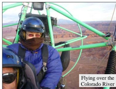
Flying over the Colorado River