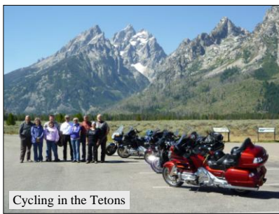
Cycling in the Tetons

But while we are trying to stay young, we look at our 27 grandchildren – with two new arrivals this year - and realize that time is marching on. They’re pretty widely scattered but we were grateful to have Kerrie and Neal and their six children move from Michigan to Utah this last summer. In July, all our kids and grandkids except Krey’s family (now in Australia) were here to enjoy the unique and rustic area where we live. Most of our neighbors live on lots with five acres or so and have all kinds of interests – from horses, elk and llamas to ATVs and flying machines. One recent campout included skeet shooting with so many shotguns you would have thought a war was going on. The neighborhood Rodeo included candy being dropped from a powered parachute as well as being shot from a giant slingshot (both compliments of Kent, of course). Keena even joined the Cedar Pass Riders for the opening ceremony. A big gully dubbed “The Grand Canyon of Eagle Mountain” runs through our property and Kent has been dreaming for years about constructing a zip line from top to bottom. So this year, he finally did it to the delight of our grandkids and families around the neighborhood.