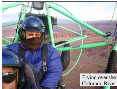
Flying over the Colorado River