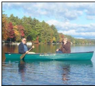
Canoeing in Maine