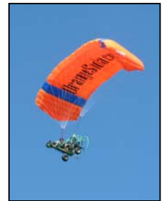
Still flying !

In October, our house was threatened, but not damaged, by a brush fire. Seems a neighbor boy was playing with matches on a particularly windy day. The next thing we knew, 10 foot flames were racing toward our house and barn. Kent ran out of the house so fast the welcome mat slid out from under him and he crashed to the ground damaging his shoulder and knee. Luckily they both seem to be recovering well. Turns out that Kent's runway served as a fire break and held the flames back until five fire trucks arrived to put everything out (see picture). Of course Kent claims that his passion for flying saved our home.