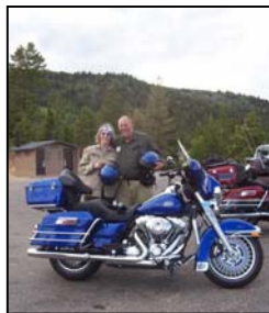
Our annual Cycle Safari