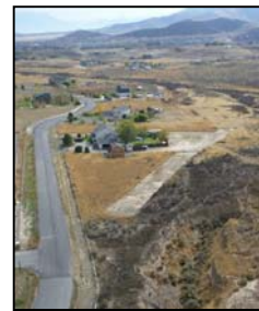
Runway is a fire break