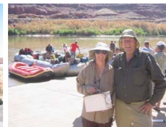
Ready to launch !