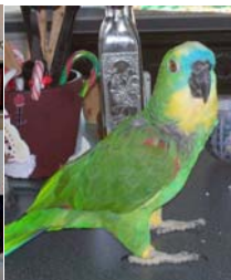
Scuffy - almost 40