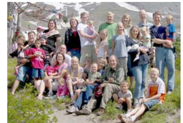
The whole clan on Mt. Hood