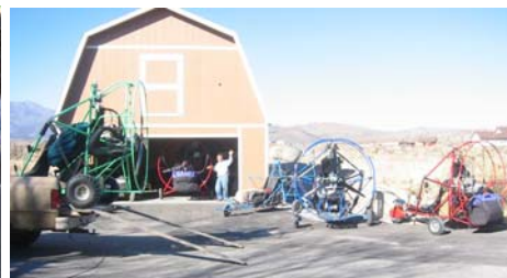
Our new barn, or should we say, hangar?