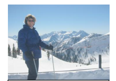
March - We take advantage of Utah's record snowfall.