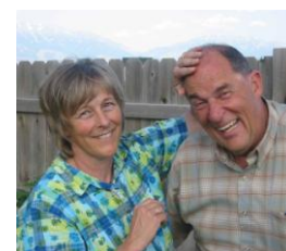
“Mmmm... I LOVE that buzzcut”